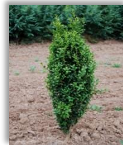
Buxus “Graham Blandy”