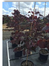
Cercis "Ruby Falls"