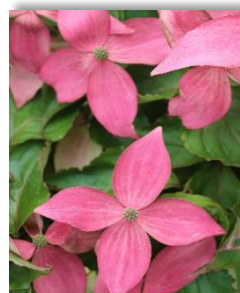
Cornus “Scarlet Fire®”