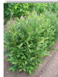
Magnolia “Royal Star”