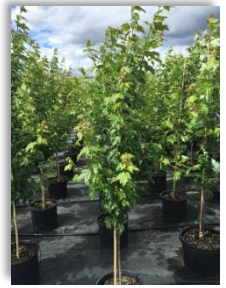
Acer rubrum “Red Sunset”