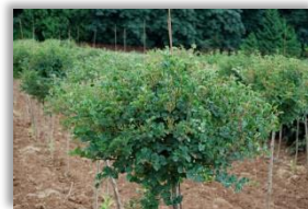
Syringa meyeri “Palibin” – Std.