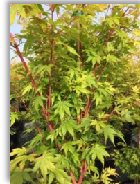
Acer palm. “Sango Kaku”