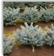
Picea pungens “Glauca Globosa”