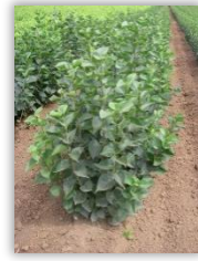
Syringa “Pres. Grevy”