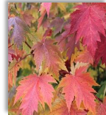
Acer freemanii “Celebration®”