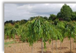
Prunus subhirtella “Pendula”