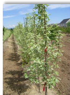
Cornus mas “Variegata”