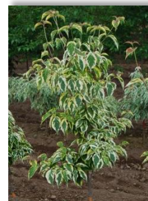
Cornus “Celestial Shadow”