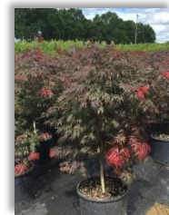
Acer palm. diss. “Orangeola”