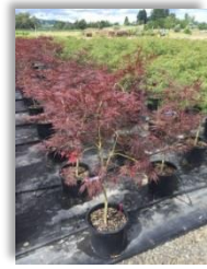
Acer palm. diss. “Tamukeyama”