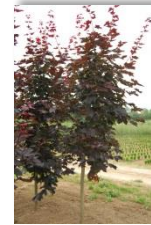
Acer “Crimson King”