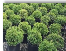
Buxus “Green Velvet”