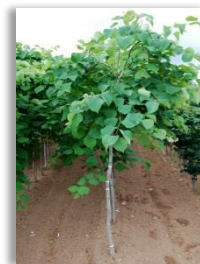
Cercis “Pink Heartbreaker”