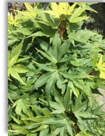
Acer palm. “Mikawa Yatsubusa”