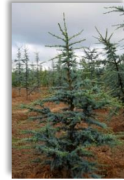
Cedrus atl. “Horstmann”