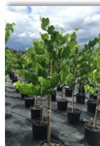
Cercis “Hearts of Gold”