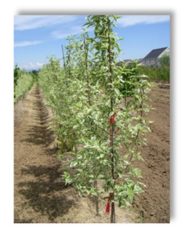
Cornus mas "Variegata"